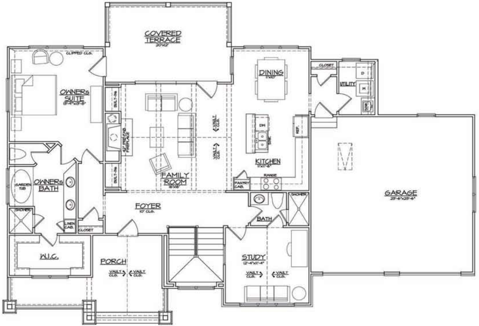
FIRST LEVEL FLOOR PLAN